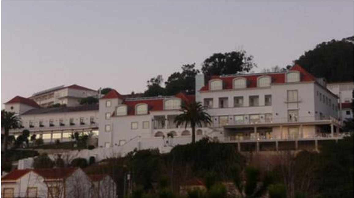
View of “Centro de Férias do INATEL”

The EYOC 2013 event center will be at “Centro de Férias do INATEL” at Foz do Arelho , part of Caldas da Rainha municipality.