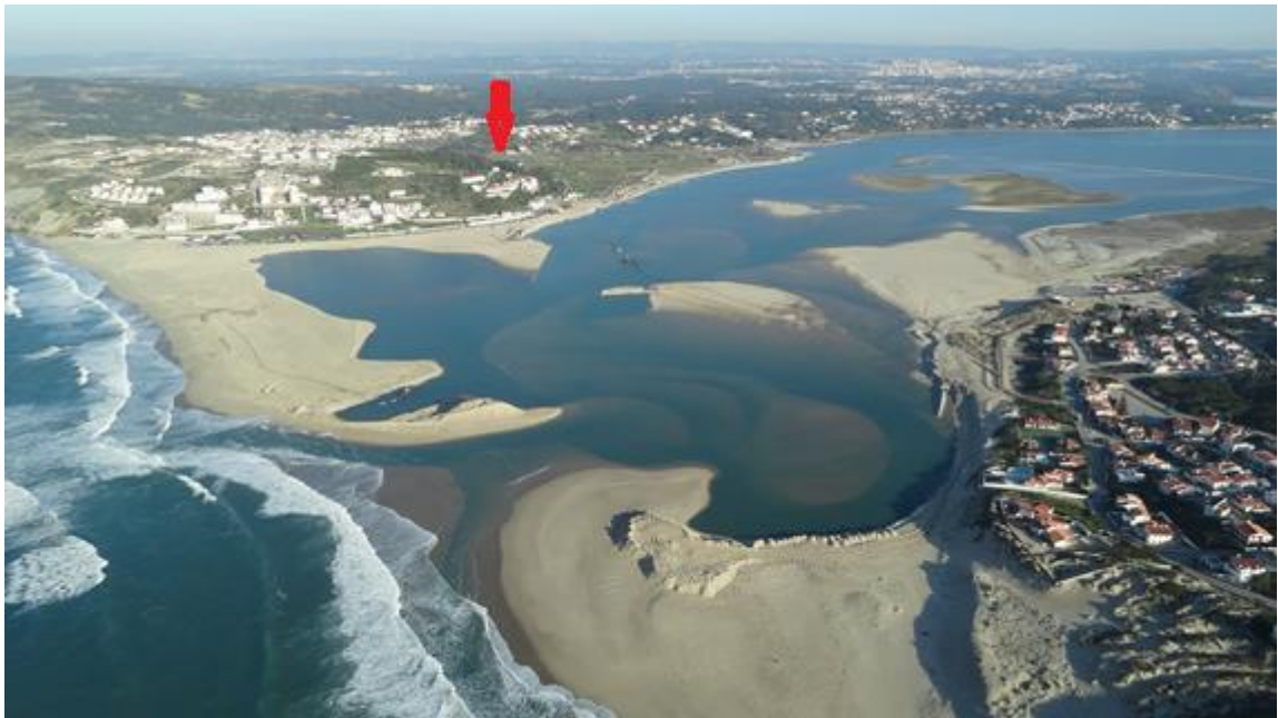
Foz do Arelho aerial view